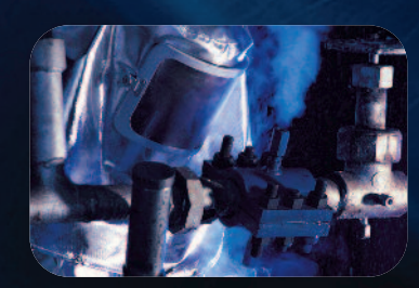
Leak Repair Services