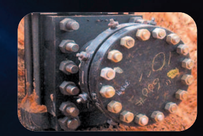
Pipe Repair Services